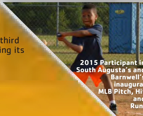
2015 Participant in South Augusta's and Barnwell's inaugural MLB Pitch, Hit and Run.