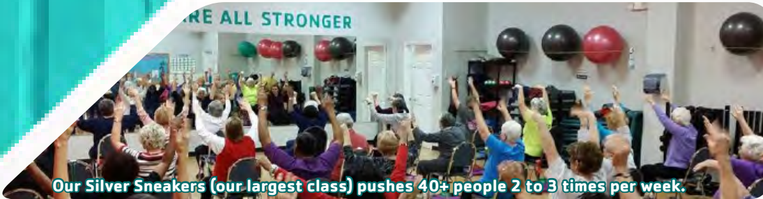
Our Silver Sneakers (our largest class) pushes 40+ people 2 to 3 times per week.

2015 was a year of growth in North Augusta. The Annual North Augusta Family YMCA Golf Tournament doubled in size in 2015 in both participation and monies raised for the Annual Campaign. The May tournament saw 17 teams come through Forest Hills Golf Club, with a net of $11,000.00 total for Annual Campaign funds. North Augusta's summer camp had an exciting summer with serving over 100 more kids over the summer than prior years. They were able to impact 716 area youth through our summer programming in 2015.