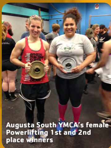
Augusta South YMCA's female Powerlifting 1st and 2nd place winners

The branch also continued its partnership for the third year with Windsor Spring Elementary School offering its PrimeTime after-school program to 30 children.