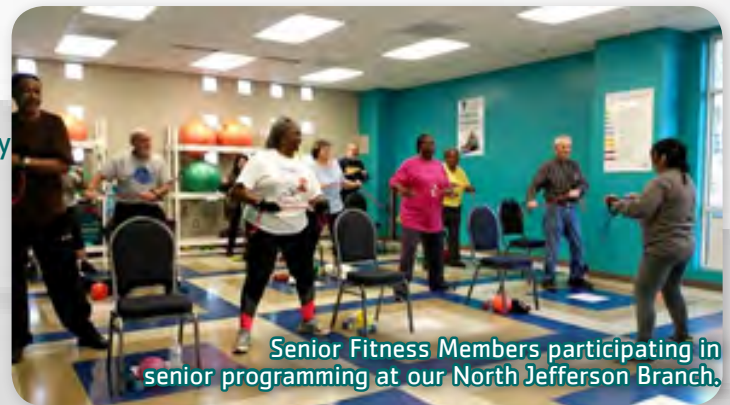
Senior Fitness Members participating in senior programming at our North Jefferson Branch.

North Jefferson also added H.I.T.T. to their program offerings in 2015. This is an outdoor circuit, high intensity interval training that hosts over 30 people twice a week.