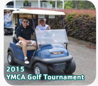
2015 YMCA Golf Tournament